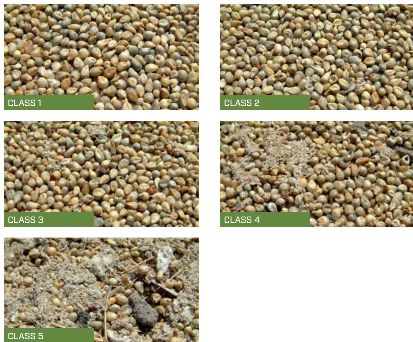
Figure 2.1 | Example of a Visual Damage Scale for Millet