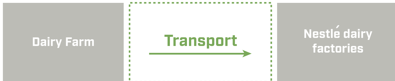
Figure 2: Lifecycle stage covered by this FLW inventory

Figure 2 elaborates on the lifecycle stage that this inventory covers. The stage where milk is transported between the dairy farm and Nestlé’s dairy factories is in scope, which includes milk rejected on receipt in the factories.